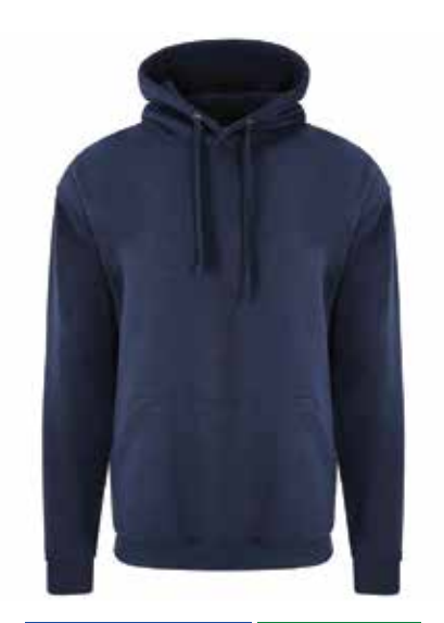
Embroidery Available Print Available