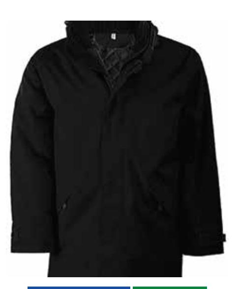
Embroidery Available Print Available