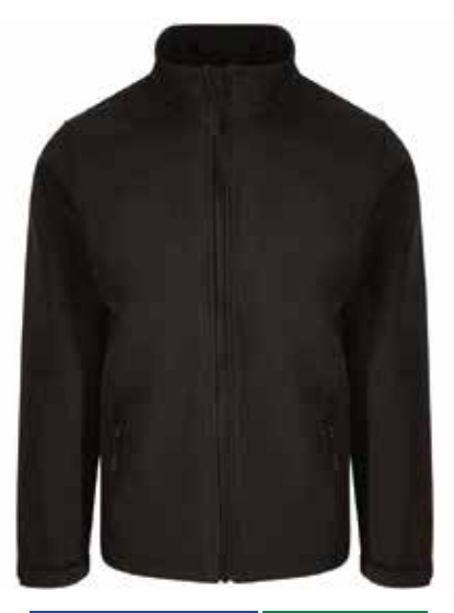
Embroidery Available Print Available