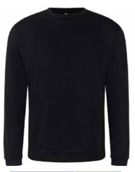
Embroidery Available Print Available