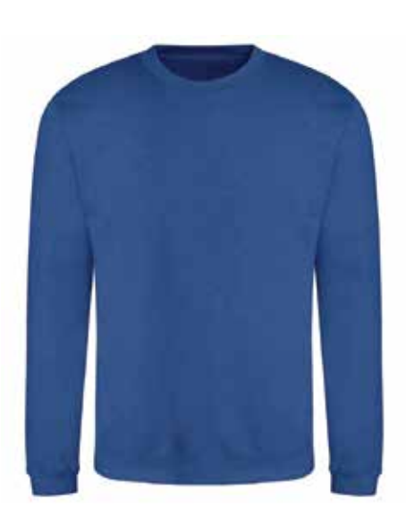
Embroidery Available Print Available