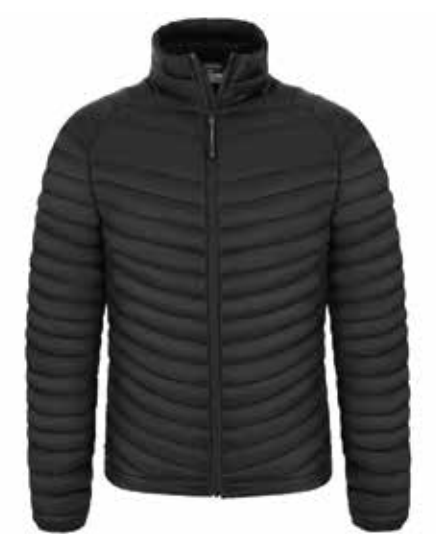
Embroidery Available Print Available