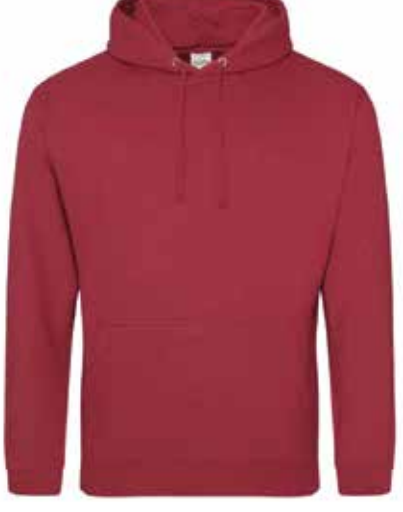
Embroidery Available Print Available