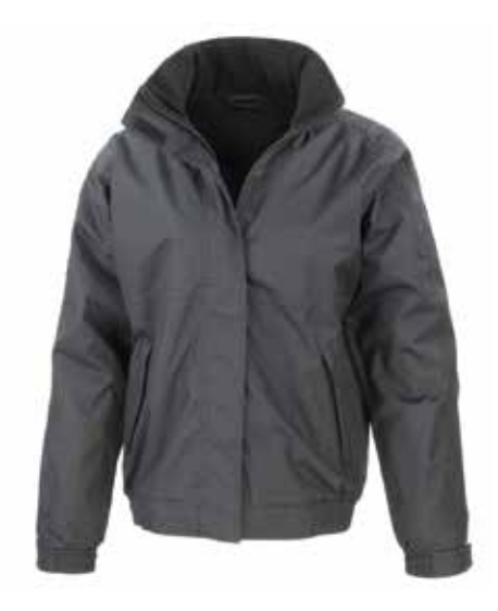
Embroidery Available Print Available