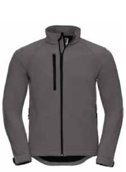
Embroidery Available Print Available